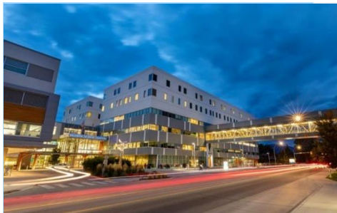
Kelowna General Hospital